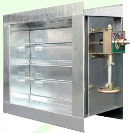
VOLUME CONTROL DAMPER (WORM GEAR)