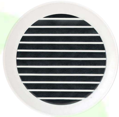
ROUND SINGLE DEFLECTION GRILLE