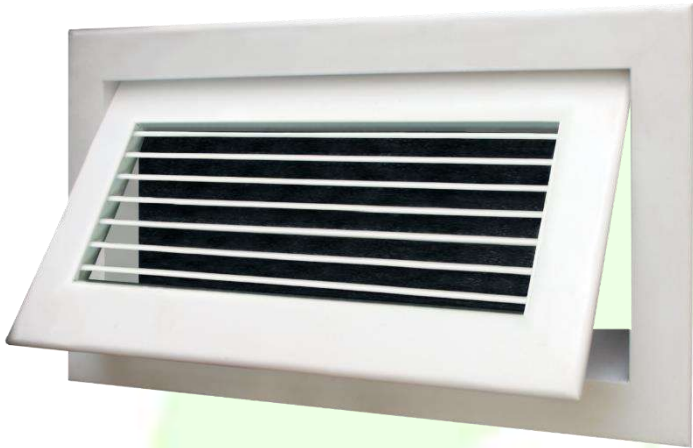
SINGLE DEFLECTION GRILLE (DOUBLE MARGIN)