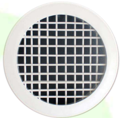
ROUND DOUBLE DEFLECTION GRILLE