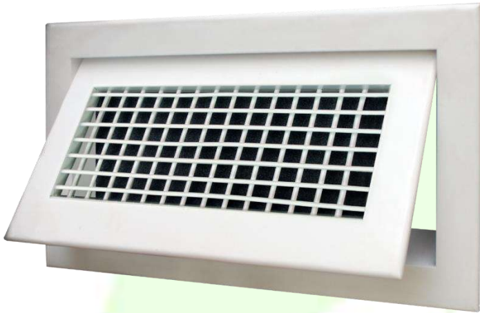
DOUBLE DEFLECTION GRILLE (DOUBLE MARGIN)